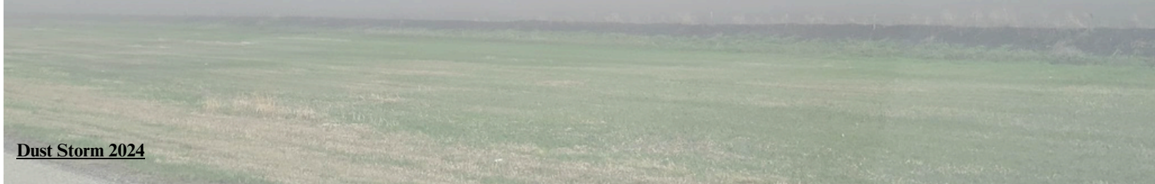
Dust Storm 2024